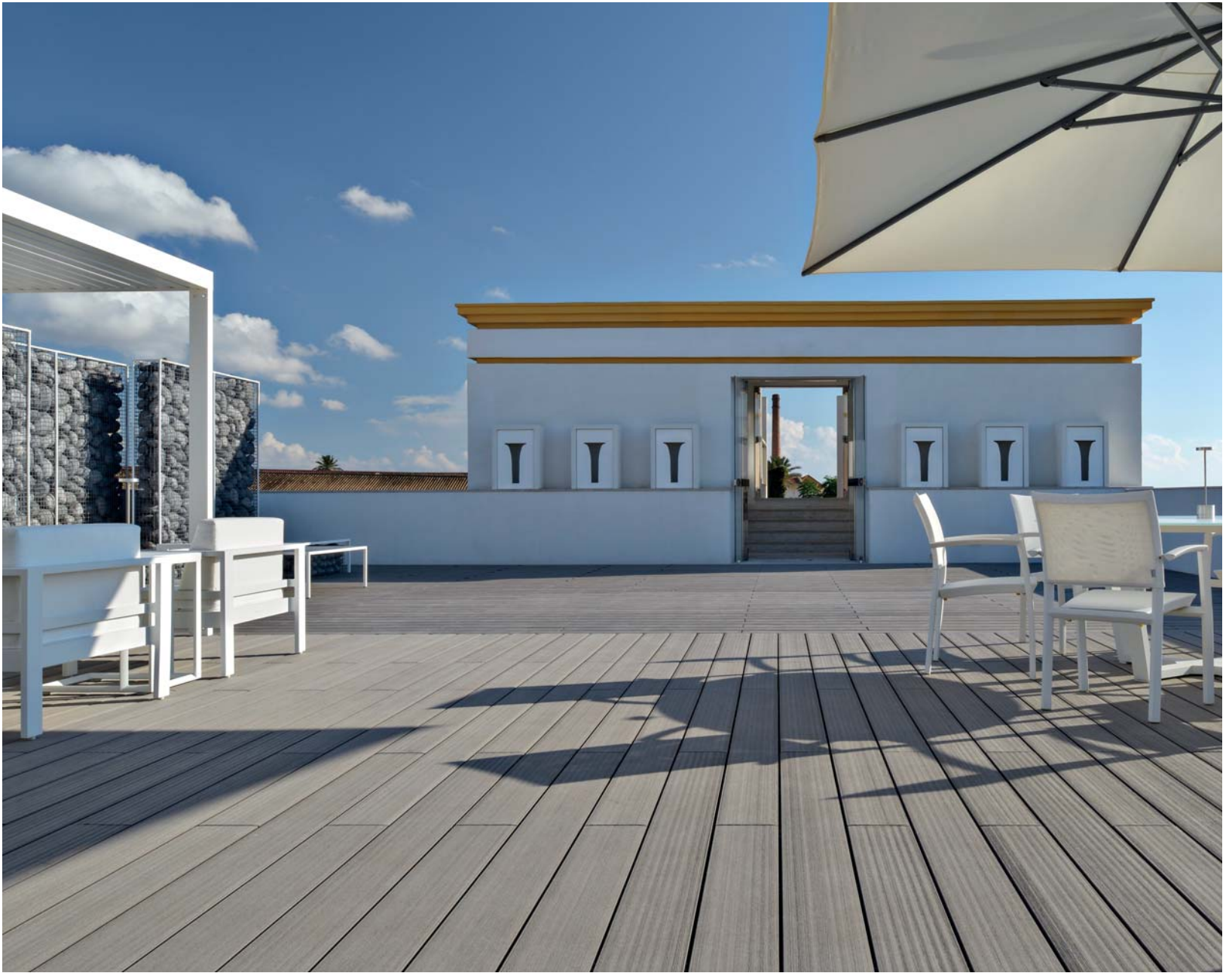
Florio Marsala Winery (GREENDECK)